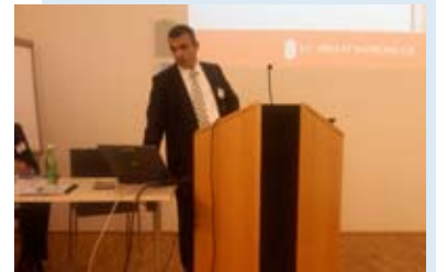
Impressions 1 st International User Group 2009, Vienna